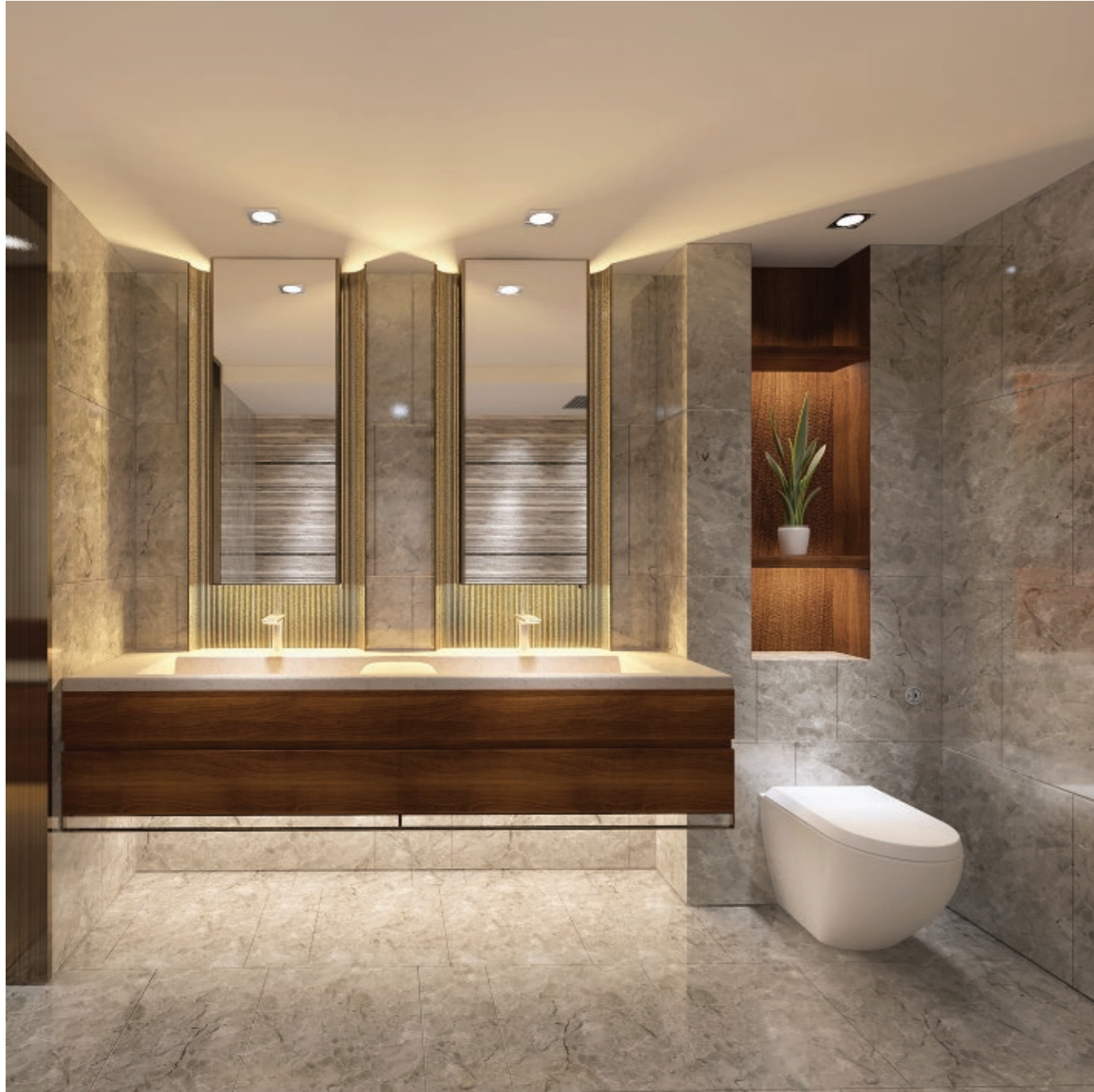
2 Bedroom unit Master Bathroom. Artists' image for illustration purposes only.