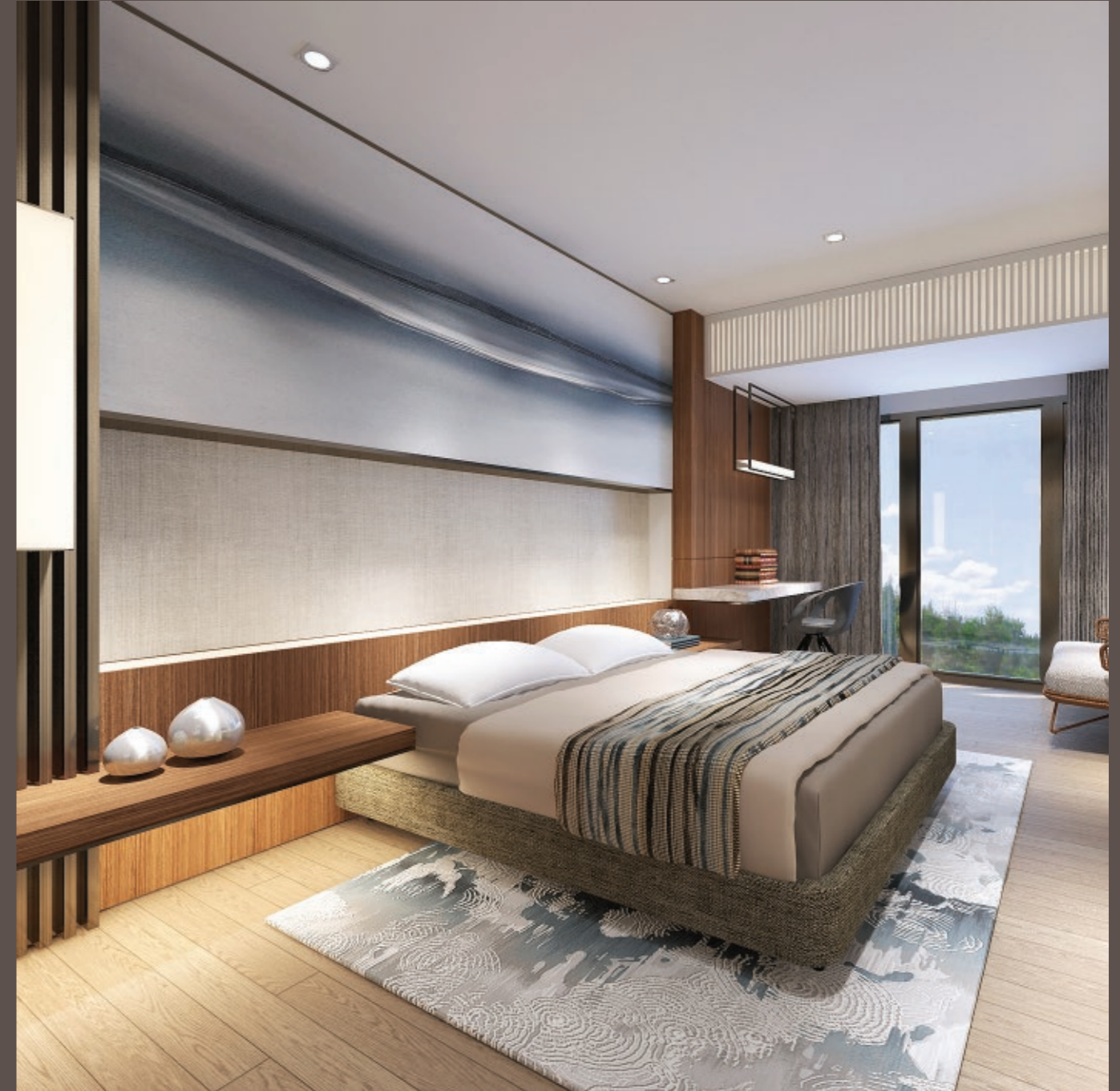
2 Bedroom unit Master Bedroom. Artists' image for illustration purposes only.