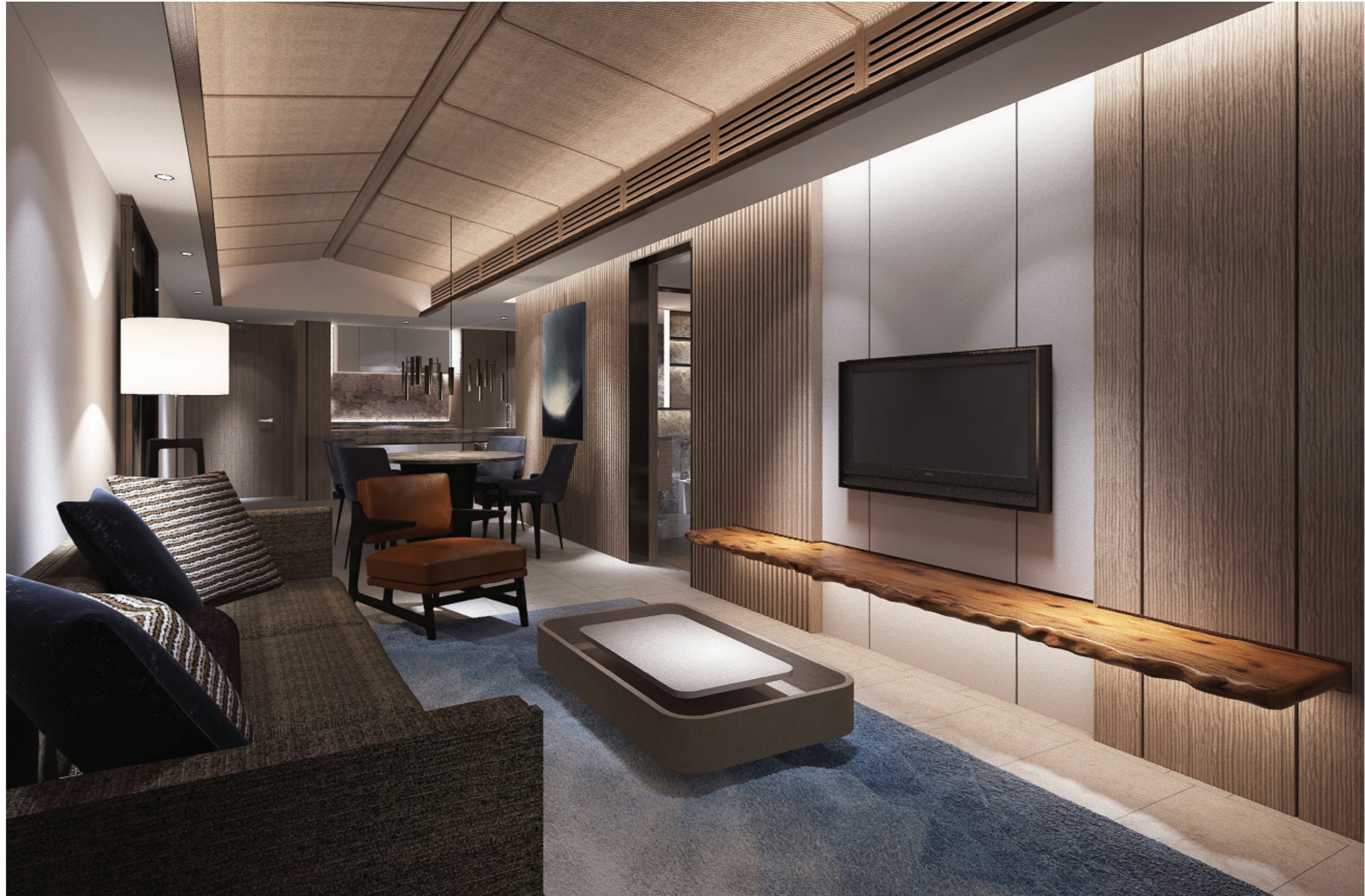
1 Bedroom unit Living Room. Artists' image for illustration purposes only.