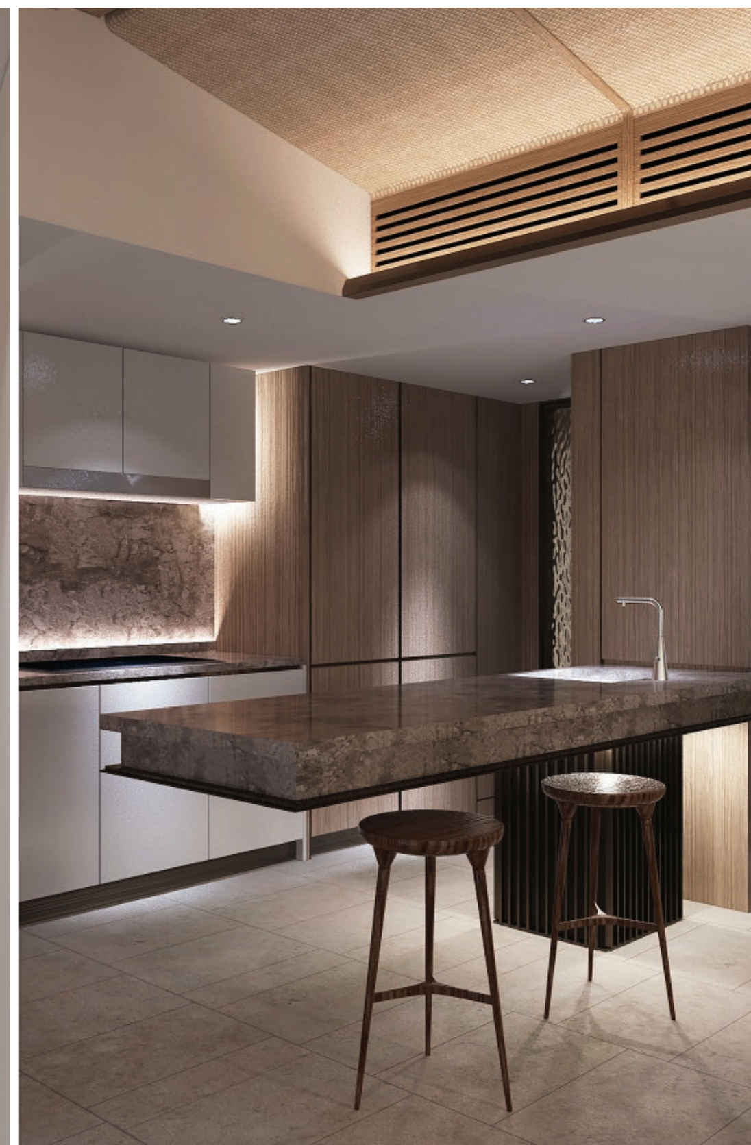
1 Bedroom unit Kitchen area + Living Room. Artists' image for illustration purposes only.