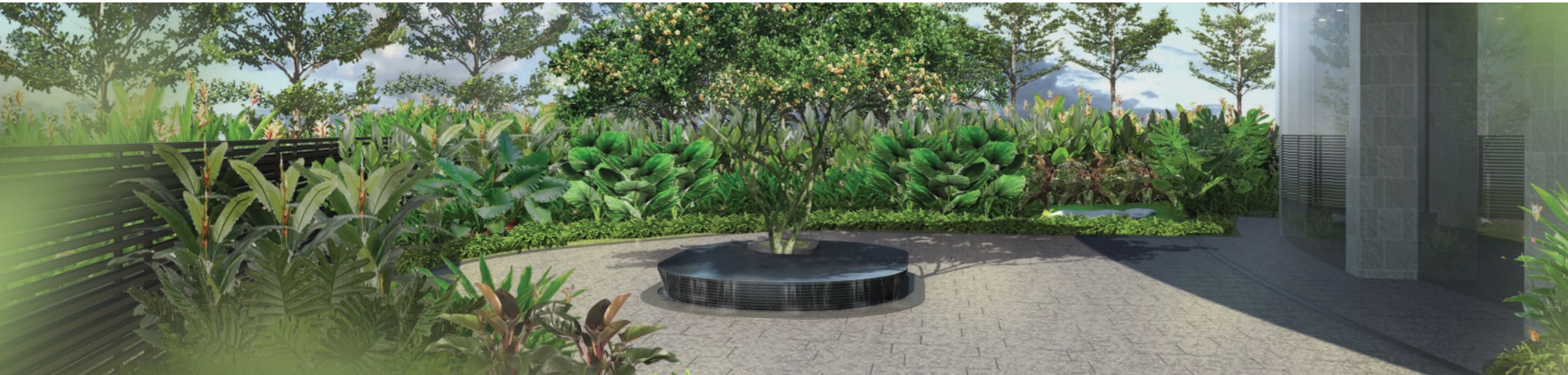
Driveway entrance. Artists' image for illustration purposes only.