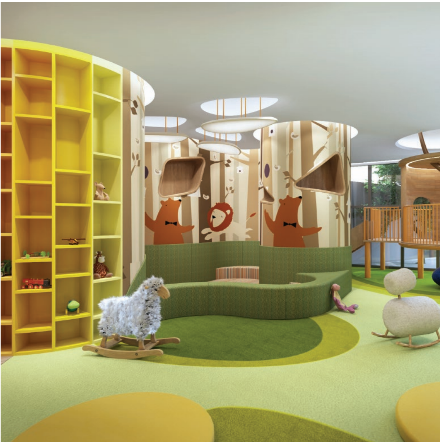
The Kids Zone. Artists' image for illustration purposes only.

Shang Residences at Wack Wack was designed with families in mind. The Kids Zone offers an exciting space for toddlers and young children to stretch their legs and explore their world.