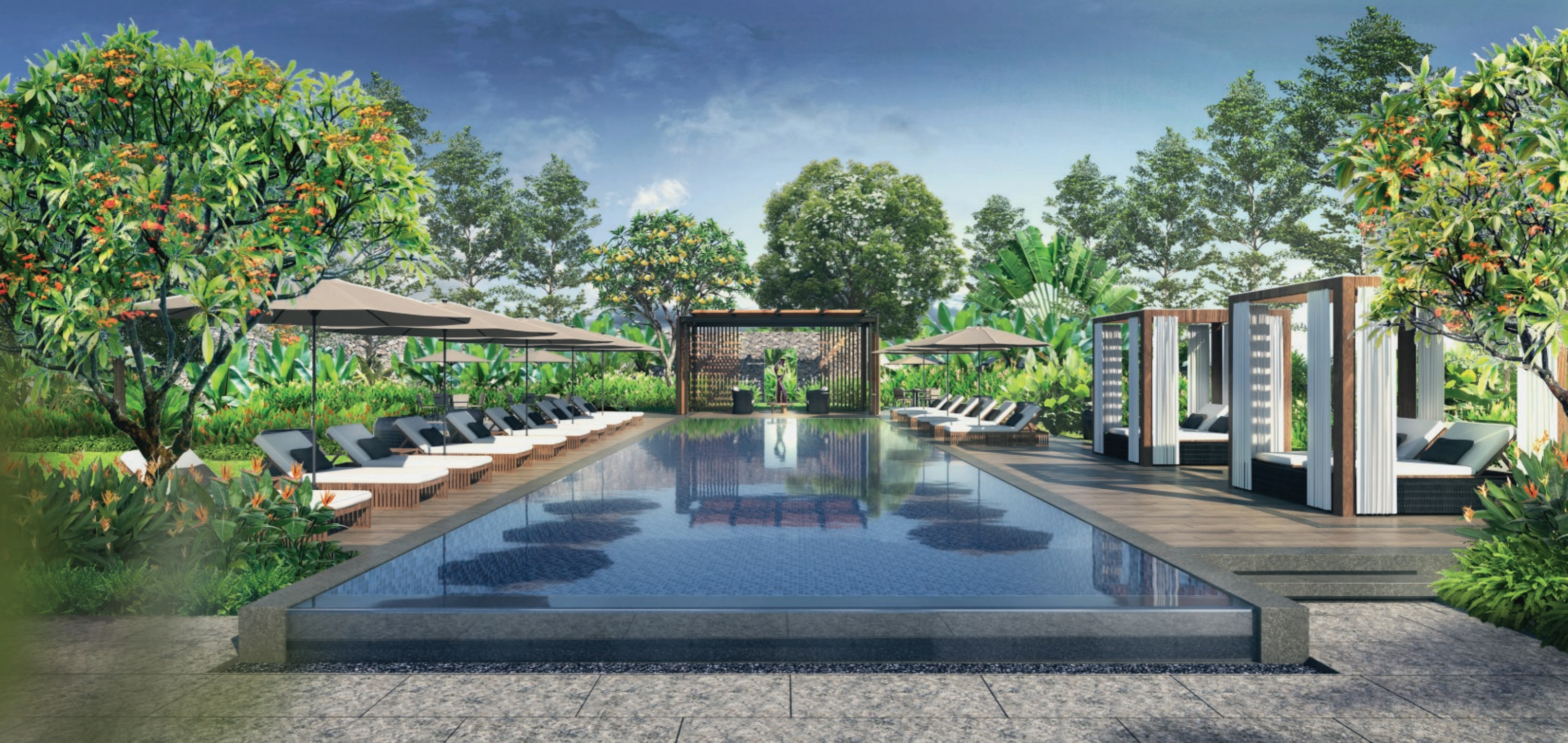
Pool area. Artists' image for illustration purposes only.