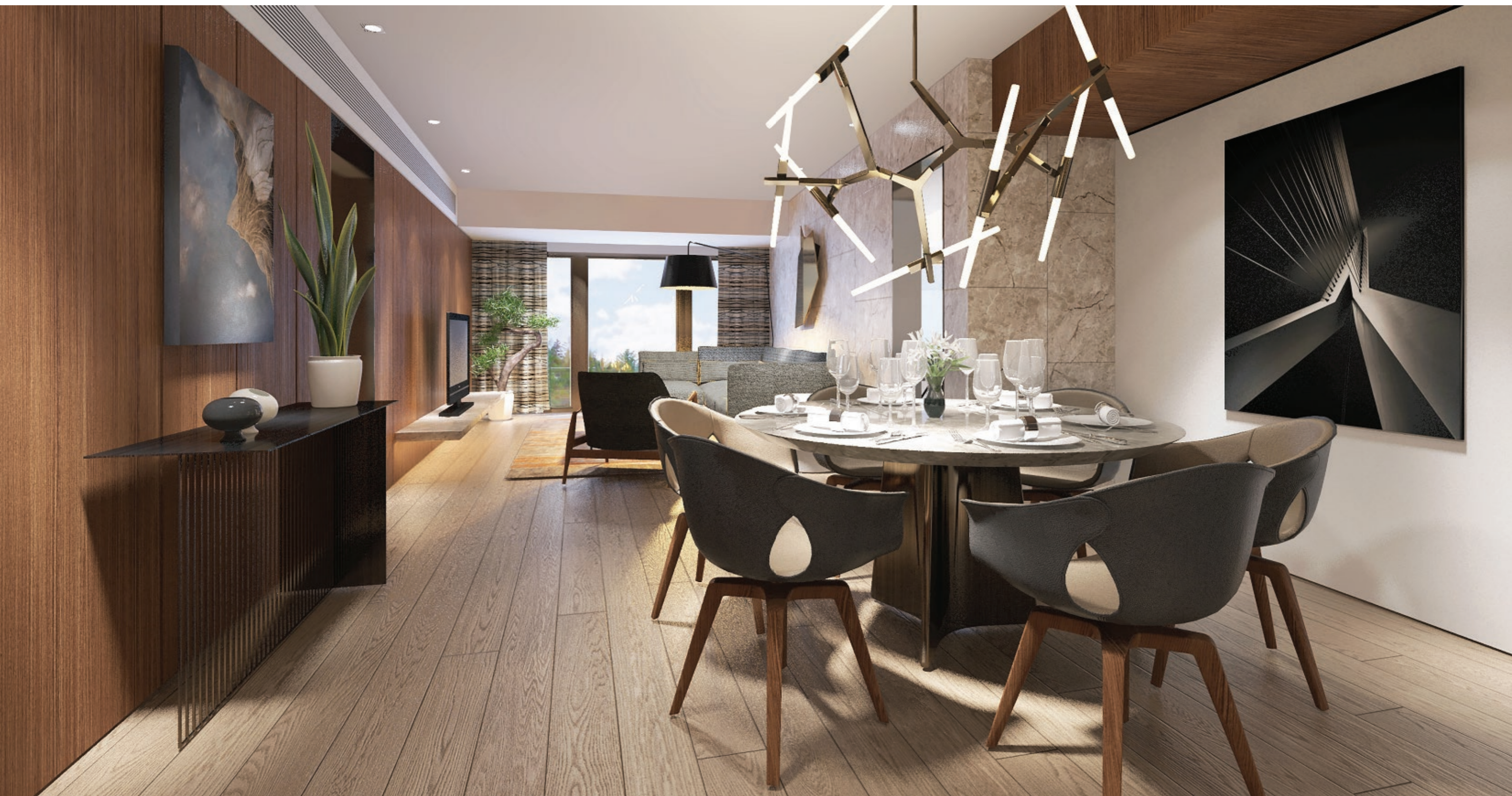
2 Bedroom unit Dining + Living Room. Artists' image for illustration purposes only.