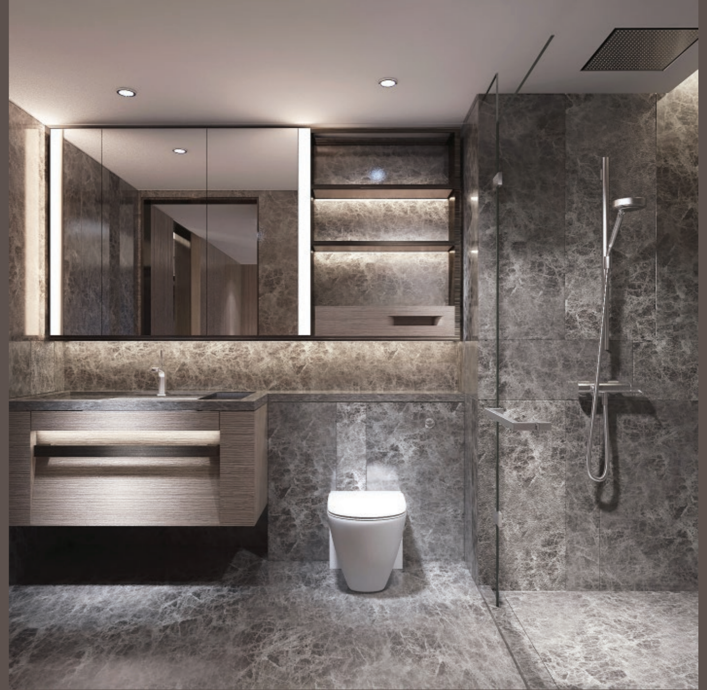
1 Bedroom unit Master Bathroom. Artists' image for illustration purposes only.