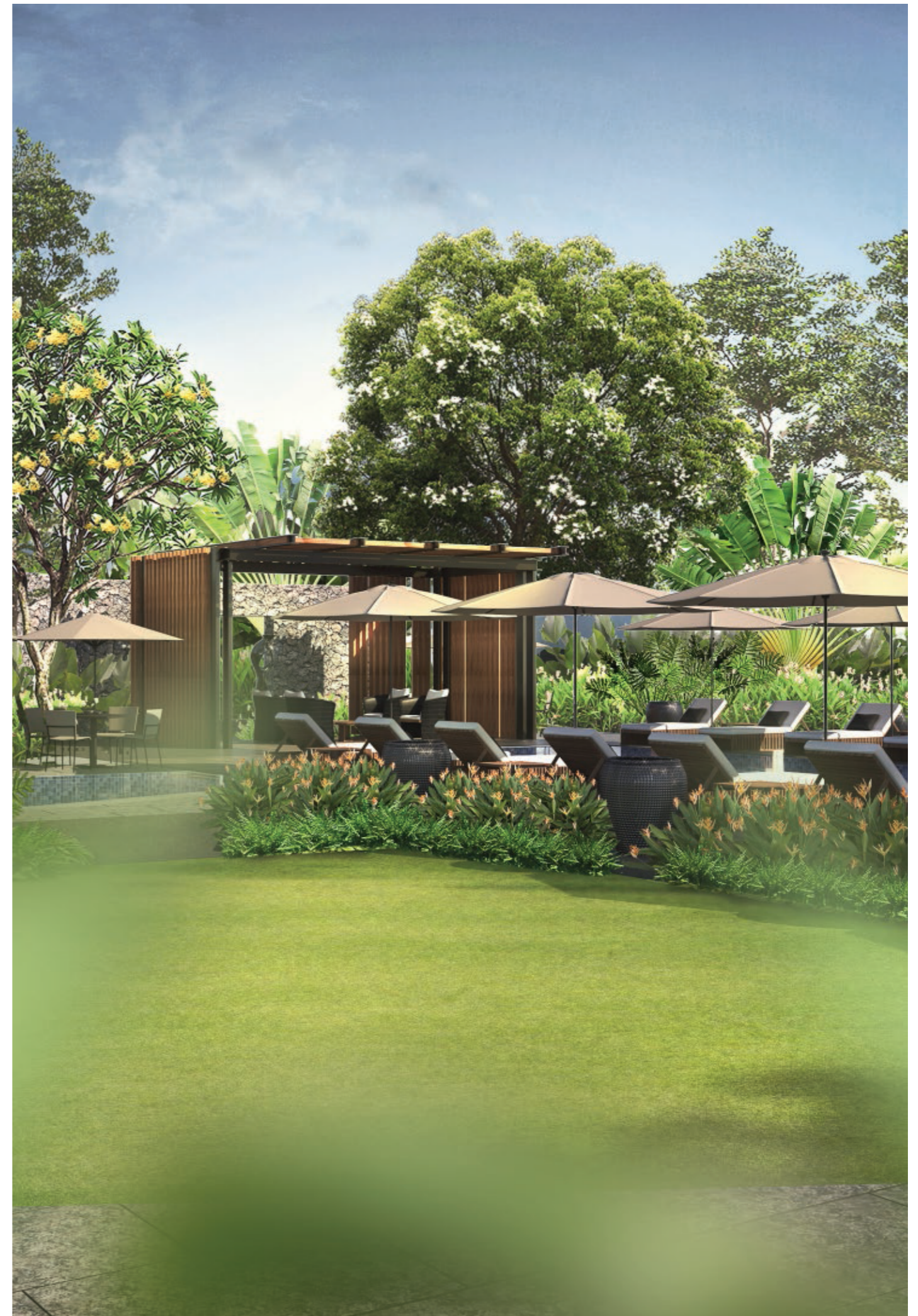
Garden. Artists' image for illustration purposes only.

Drawing inspiration from contemporary tropical luxury resorts - where it is as much about warm, thoughtful, and impeccable service as it is about carefully-crafted, meticulously designed details - our vision is to create homes that people feel innately drawn to, coupled with magnificent, unobstructed views over Wack Wack Golf & Country Club . Shang Residences at Wack Wack is your home in the city to unwind, contemplate, and rejuvenate.