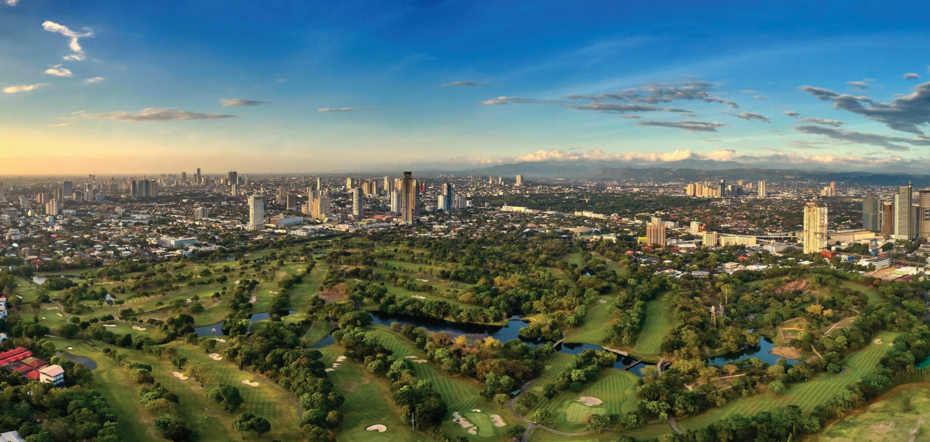
Actual photo of Wack Wack Golf & Country Club.

At the heart of the Wack Wack neighborhood and providing an exquisite backdrop to the panoramic views at Shang Residences at Wack Wack is one of the country's finest golf courses.