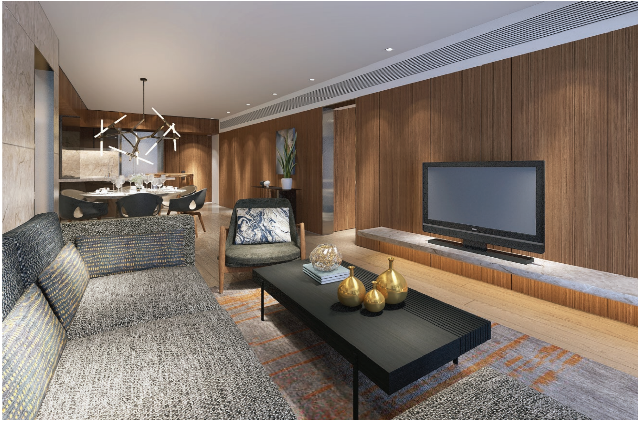
2 Bedroom unit Living Room. Artists' image for illustration purposes only.