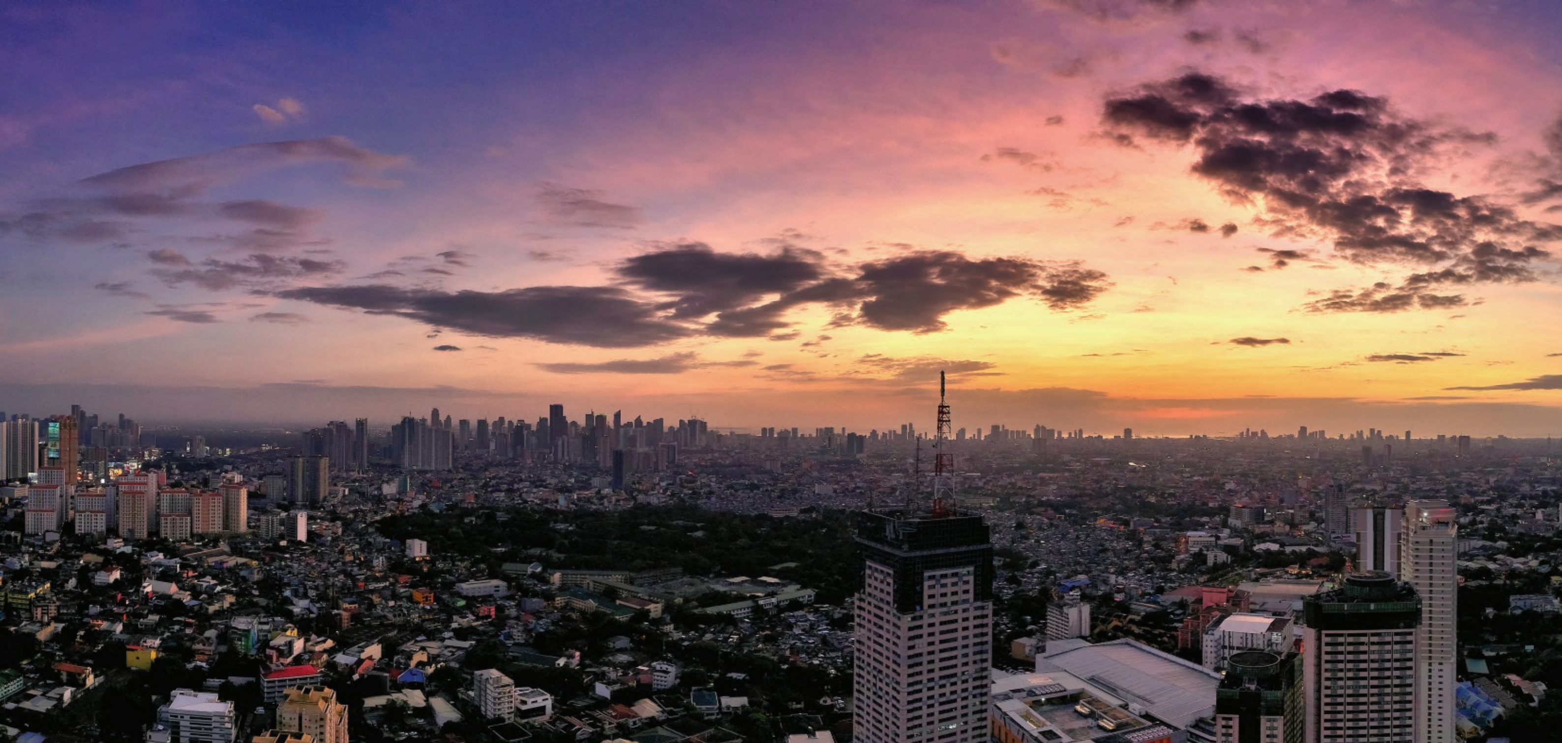
Actual photo of Makati Skyline.