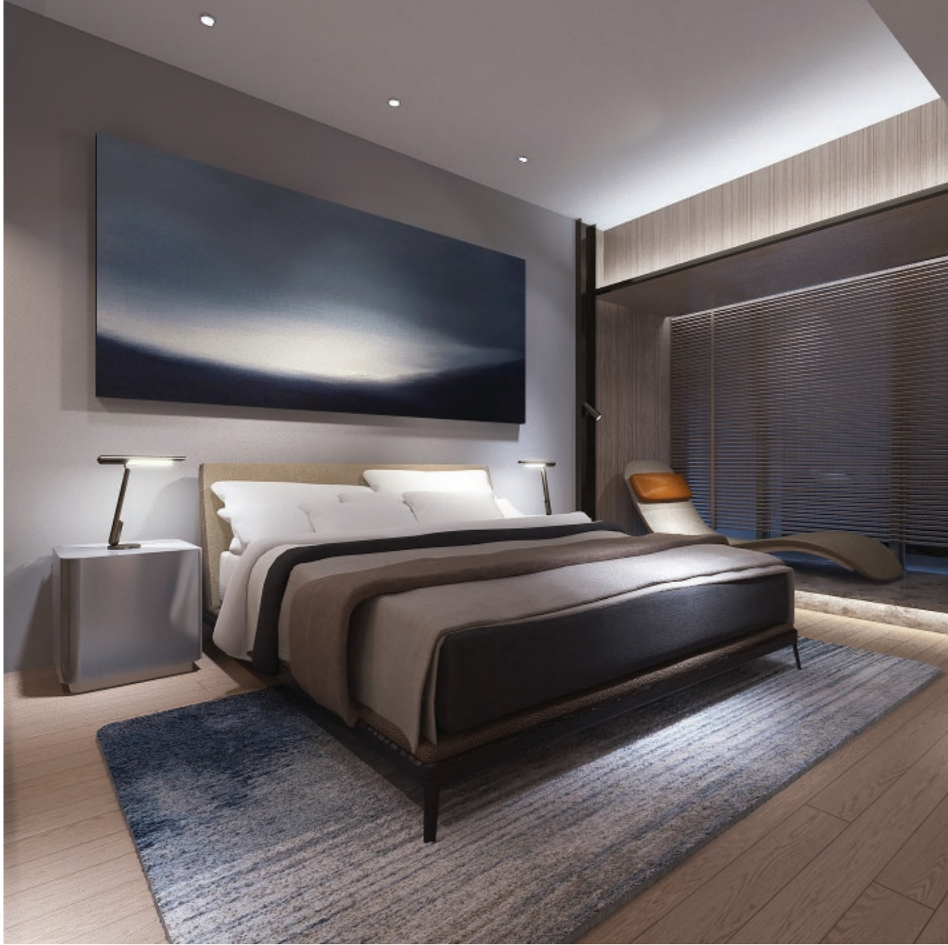
1 Bedroom unit Master Bedroom. Artists' image for illustration purposes only.