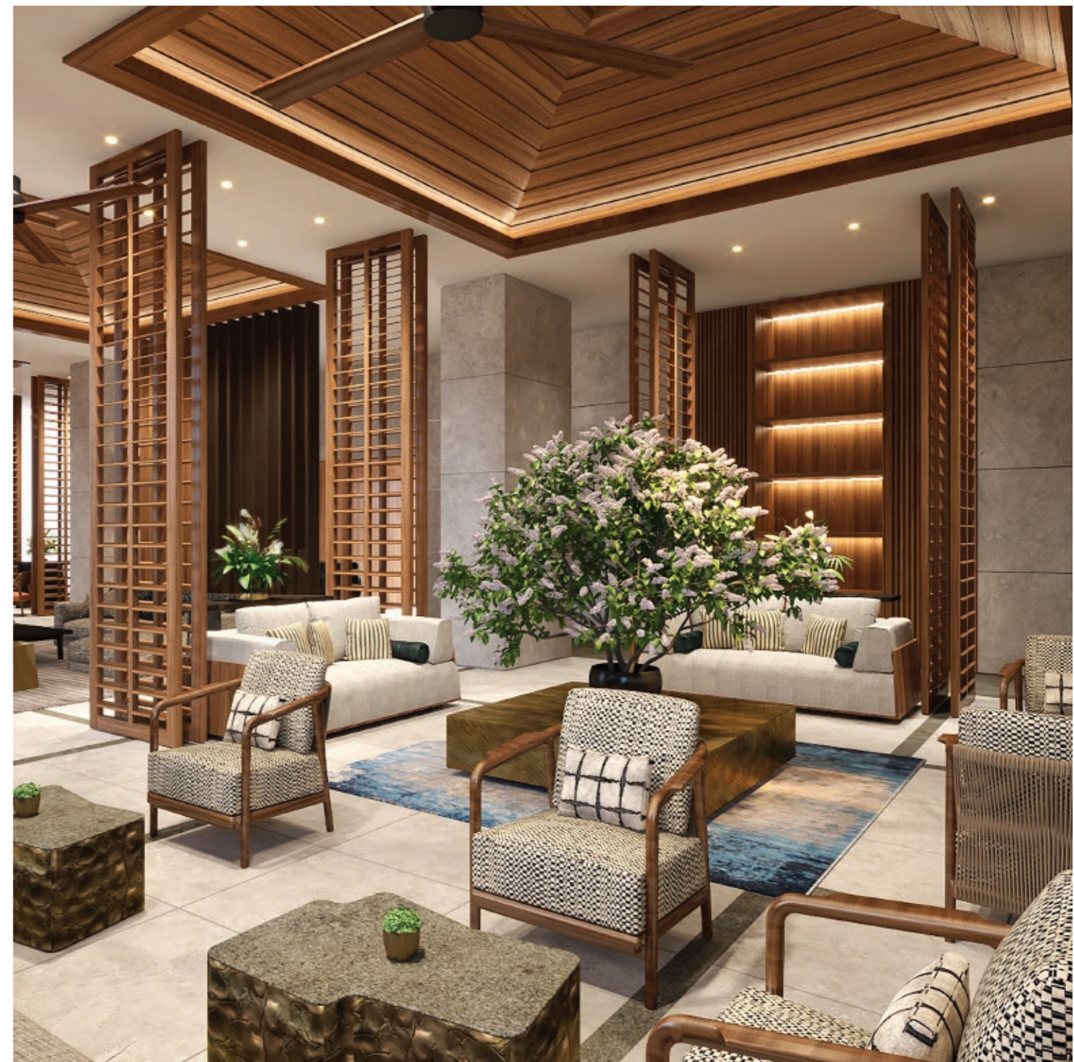
The Lounge. Artists' image for illustration purposes only.

Shang Residences at Wack Wack was designed with families in mind. The Kids Zone offers an exciting space for toddlers and young children to stretch their legs and explore their world.